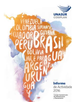
COSIPLAN Activity Report 2016

As in previous years, the Project Portfolio and API reports present the progress attained by the integration projects and include aggregate analyses of the main variables of these portfolios.