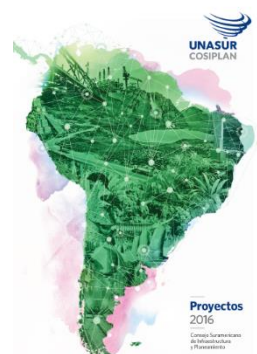
COSIPLAN Project Files 2016