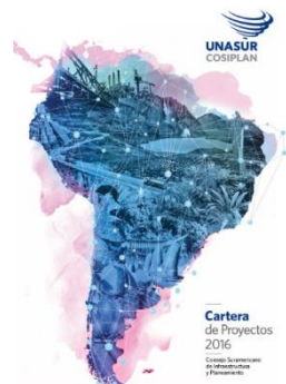
COSIPLAN Project Portfolio Report 2016

The CCT Secretariat reported that the following reports are already published: