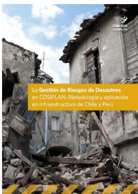
Disaster Risk Management in COSIPLAN: Methodology and Application to Chilean and Peruvian Infrastructure

The CCT Secretariat reported that the following reports are already published: