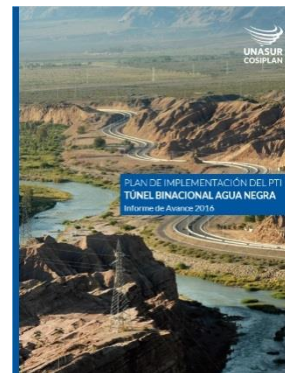
PTI Implementación Plan: Progress Report 2016

These reports are available in digital format on the COSIPLAN website, and hard copies have already been sent to Argentina and Chile and will be sent to the countries requesting them. The reports are attached as Annexes 4 and 5.