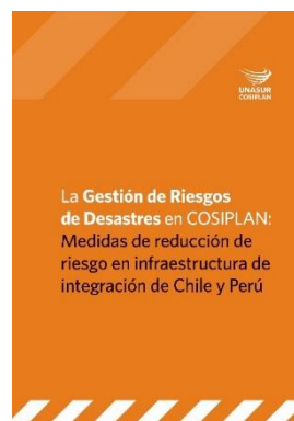
Disaster Risk Management in COSIPLAN: Risk Reduction Measures in Chilean and Peruvian Integration Infrastructure

The reports will be available in digital format on the COSIPLAN website, and hard copies will be sent to Chile and Peru as well as to the countries requesting them. The reports are attached as Annexes 6 and 7.